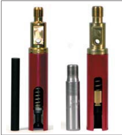
Figure 3 and Figure 4

The upper wickered slips in both the combination and overshot socket will engage rod body breaks. However the overshot socket replaces the lower wickered slips with a lower slip unit in the lower bowl which allows this tool to swallow API Class T and SM (spray metal) couplings, the pin-shoulder of the sucker rod, and the fishing neck of the valve rod guide on the subsurface pump. In operation, the “fished” component forces the slip unit in the lower bowl up until the “fish” enters the slip unit of the lower bowl. Once the “fish” enters the overshot socket, the lower slip unit drops, under spring tension, between the shoulder of the “fish” and the shoulder in the lower end of the bowl. Thus, the “fish” is caught and can’t get out. Some operators prefer an overshot socket that consists only of the lower bowl, spring and slip unit assembly. This modified overshot socket can be achieved by removing the upper bowl assembly and engaging the top bushing with the lower bowl assembly.